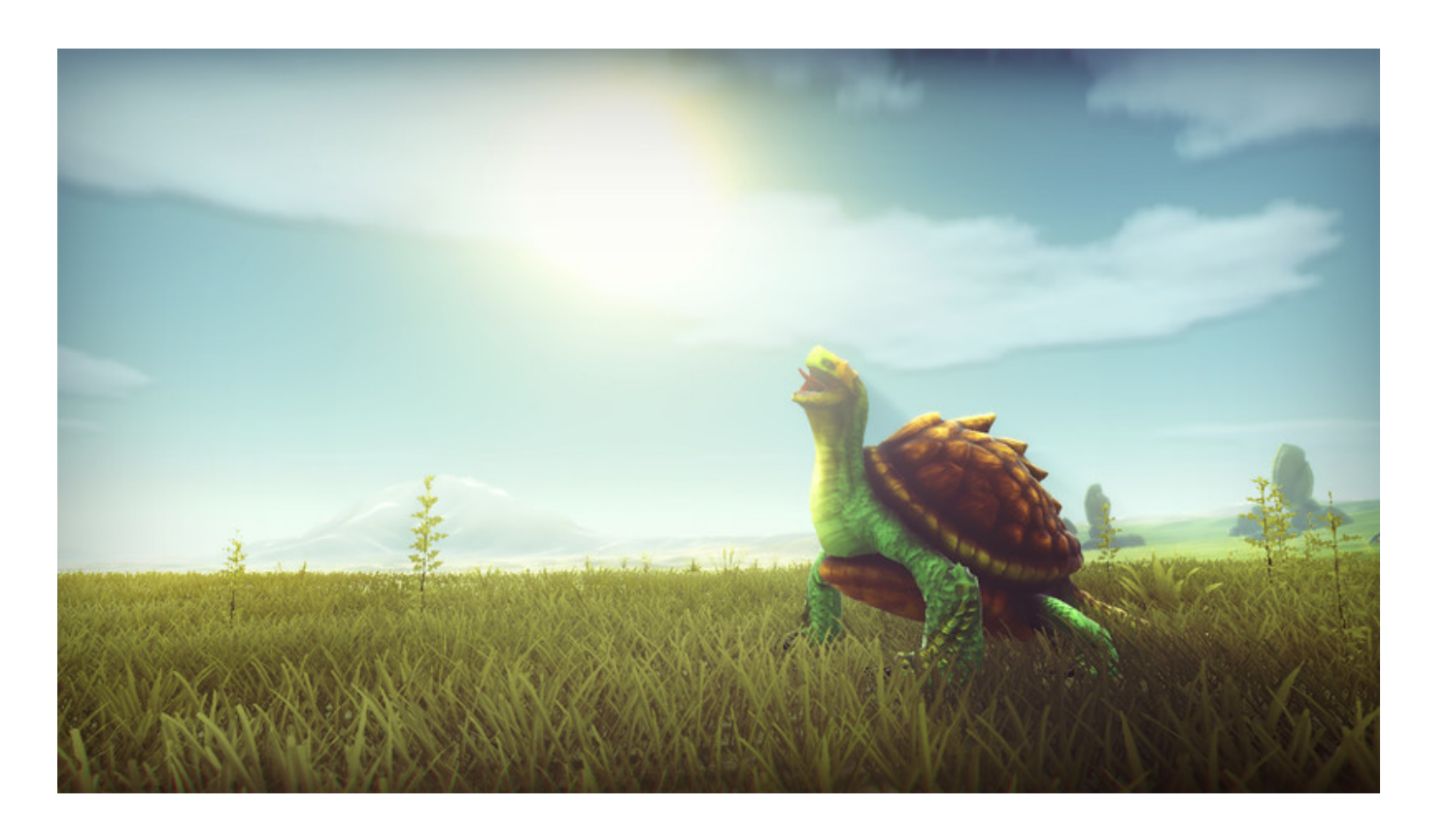
Amaze VR - Rom Com Pack 1 Free Download [Torrent]

Download ->>->> <a href="http://bit.ly/2SJQ3rv">http://bit.ly/2SJQ3rv</a>